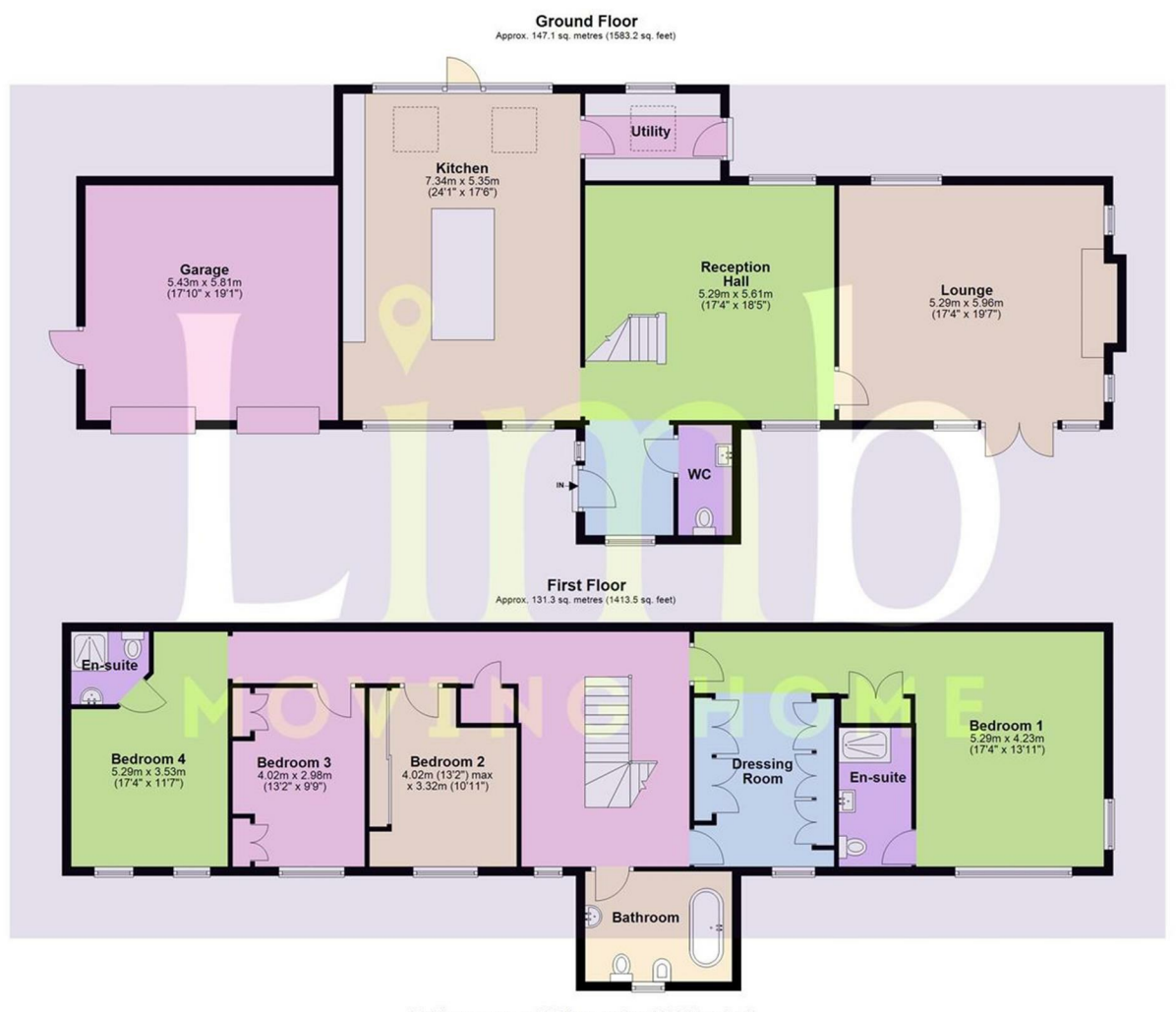
Total area: approx. 278.4 sq. metres (2996.7 sq. feet) Orchard House